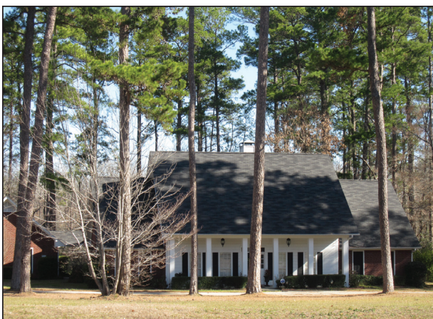
Landscaping reduces energy cost by providing shade from the home.

Firewise landscaping can be achieved along with other landscaping goals of landowners. Creating a safer Firewise landscape can easily fit into multiple goals just by using the right plants and proper spacing.