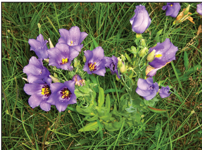
The high moisture content of the Texas bluebell makes it slower to ignite.