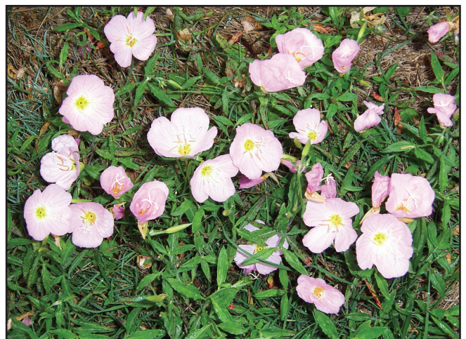
Mexican primrose, a low growing plant, helps maintain the vertical separation of fuels.