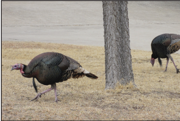
Landscaping provides habitat for wildlife.