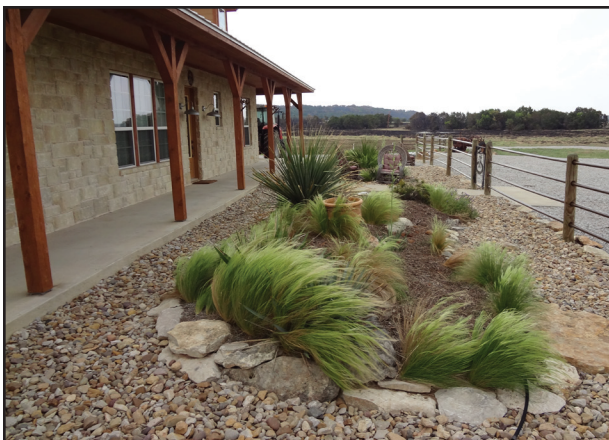
Native xeric landscaping allows water-wise practices to create a landscape that will flourish in hot and dry conditions.