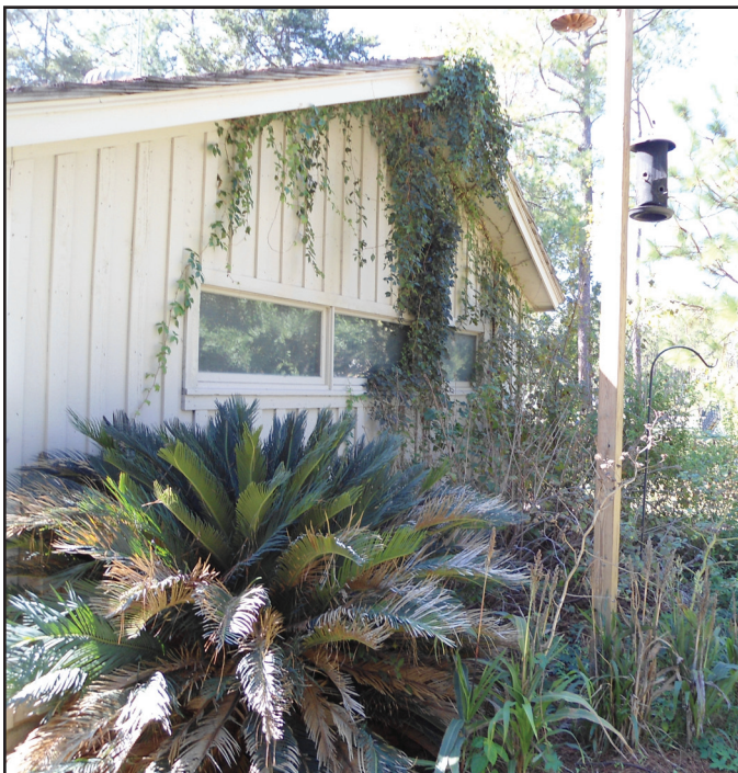
Overgrown vegetation that is within the 30 feet of defensible space can produce significant heat, potentially igniting the home.

Decks and siding easily can ignite when plants that burn quickly and produce high heat are placed adjacent to the home. A burning plant or group of plants in front of windows can cause glass breakage allowing fire to enter the home. Taller flames adjacent to the home can enter through the soffits. These flames may reach combustible materials and cause material failure, such as gutter or siding that melts, exposing the wood.