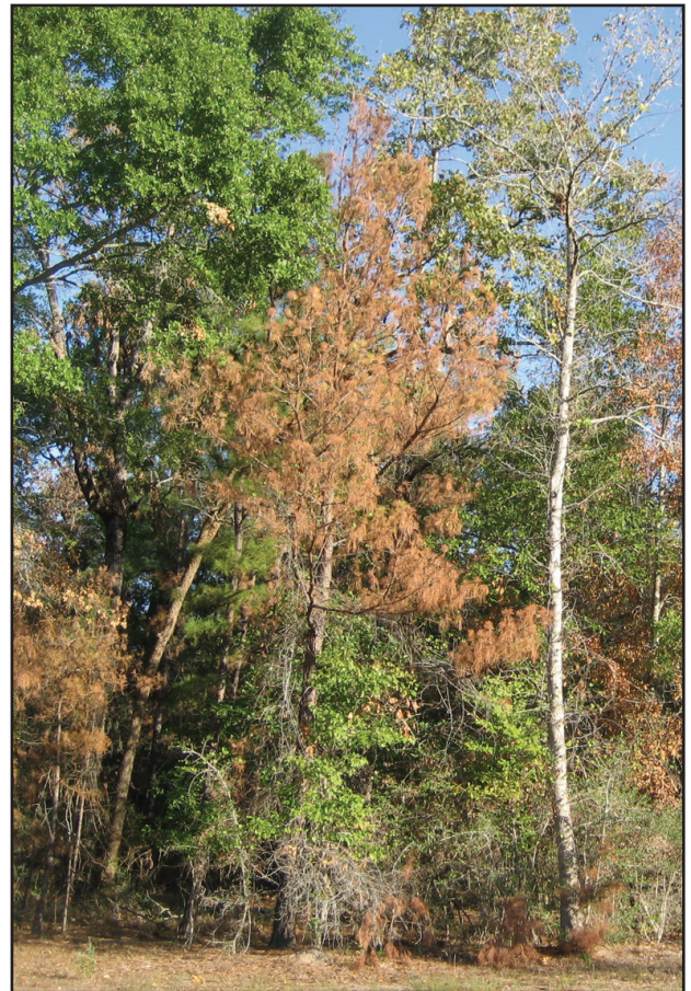
Ladder fuels allow ground fires to spread to the crowns of trees. Once in the crowns, a wildfire is very hard to stop.

Plants placed so that a fire can spread to your home increase the chance of your home receiving direct flame and embers as the fire spreads. Your home is a continuation of the fuel. Creating “defensible space” will greatly reduce your home’s risk to wildfire.