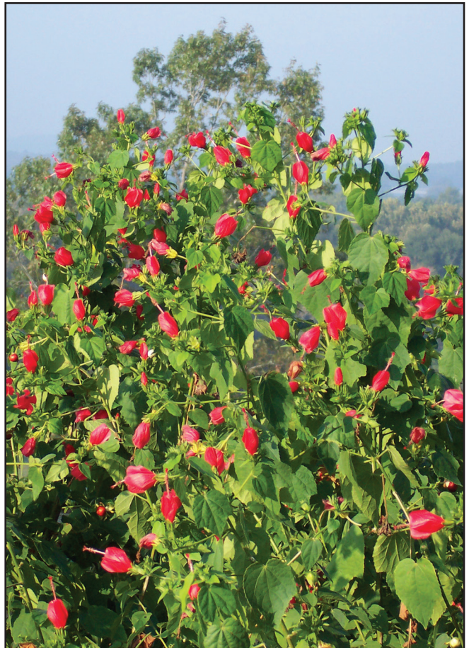
The low oil content of Malavaviscus "Big Momma" makes this plant less flammable.