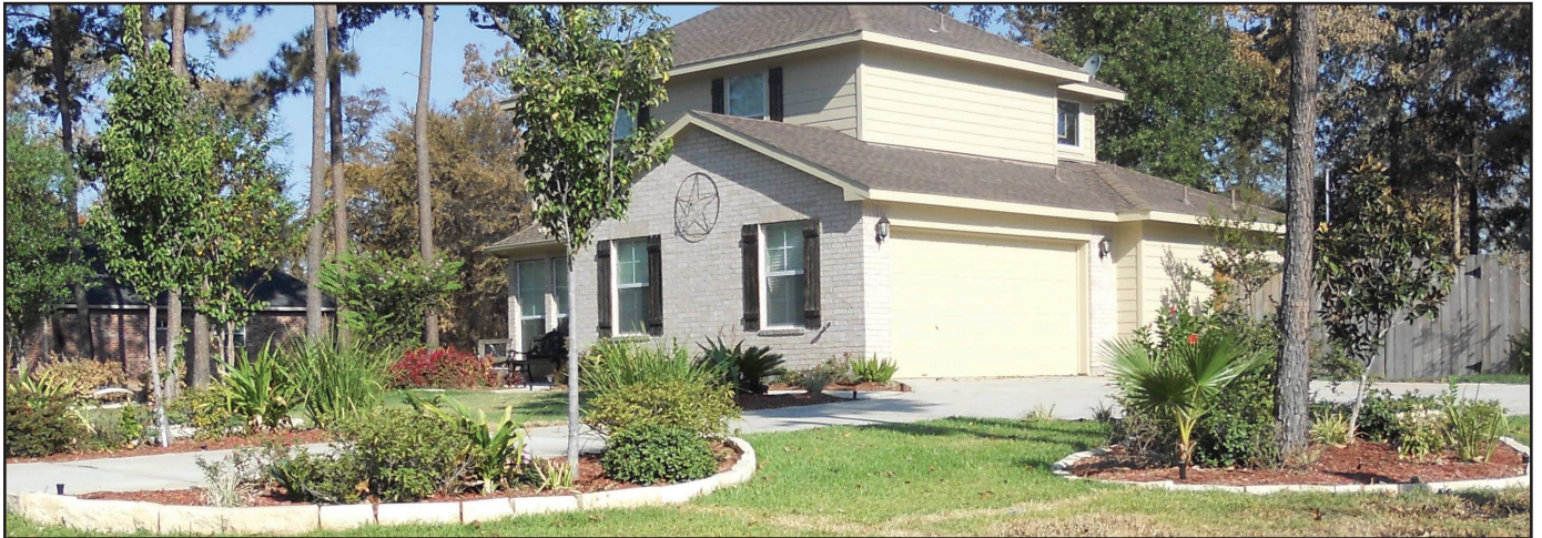
Island landscaping allows for space between fuels and will slow the spread of fire.

In Firewise landscaping, choose design elements using vertical and horizontal separation of plants. The most important portion of the home ignition zone is the defensible space. Highly flammable plants should be removed or isolated. Plants or plant groups should be placed using vertical and horizontal separation, breaking up the fuel continuity. Also remove dead and dying plants and plant materials.