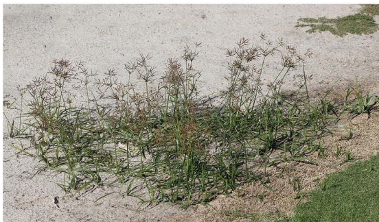
Purple Nutsedge Cyperus rotundus