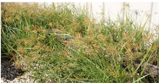
Yellow Nutsedge (perennial) Cyperus esculentus L.