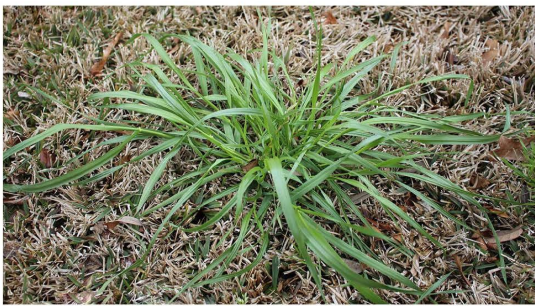
Annual Ryegrass Lolium multiflorum