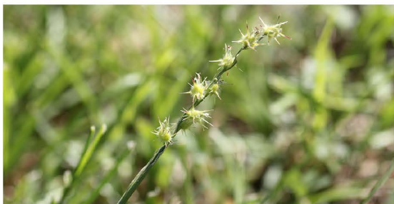
Sandbur Cenchrus spp.