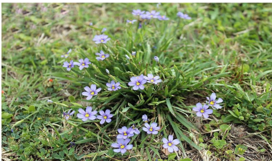
Spring Starflower Ipheion uniflorum (Lindl.) Raf.