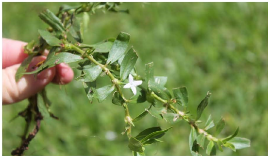
Virginia Buttonweed Diodia virginiana L.