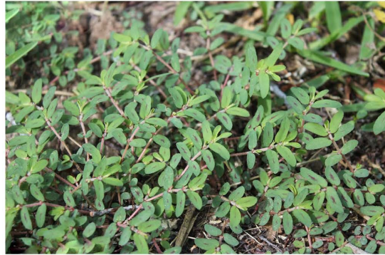
Spotted Spurge Chamaesyce maculata L.