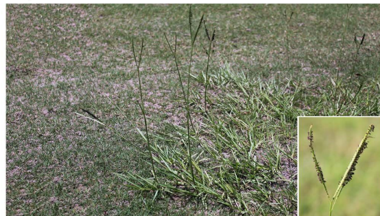
Bahia grass Paspalum notatum Flugge