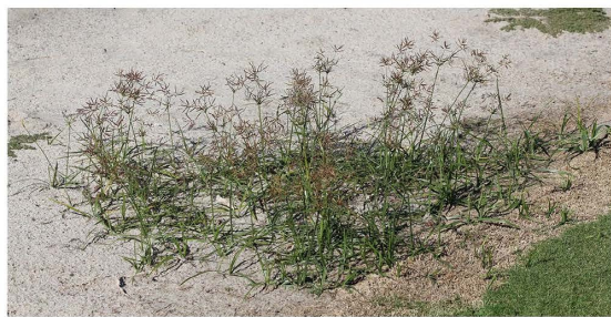
Purple Nutsedge (perennial) Cyperus rotundus L.