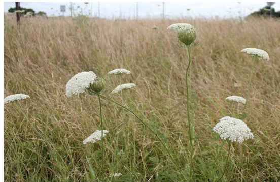
Wild Carrot Daucus carota L.