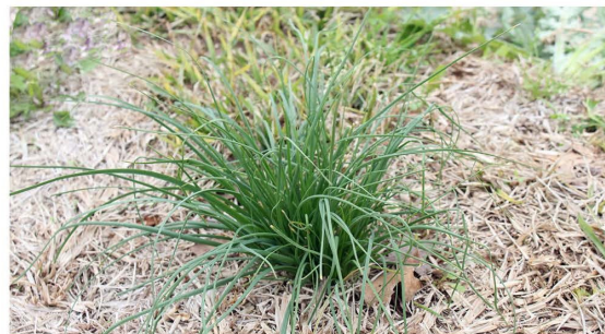
Wild Onion Allium canadense L.