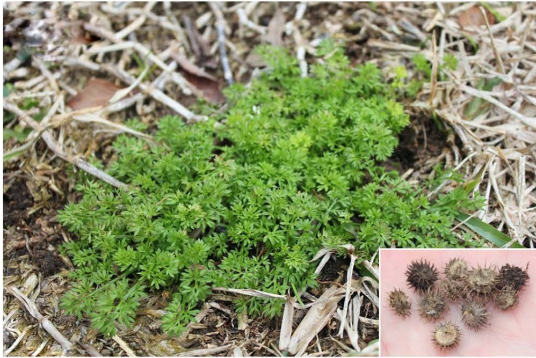
Lawn Burweed Soliva sessilis Ruiz & Pavon