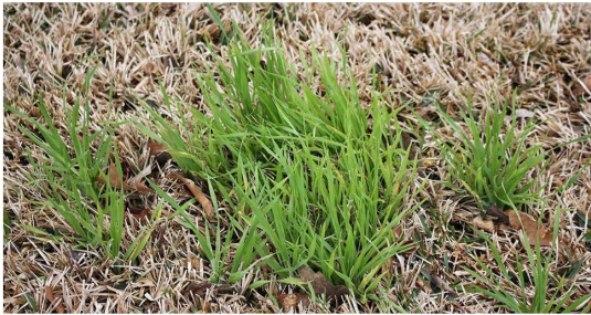
Rescuegrass Bromus catharticus Vahl