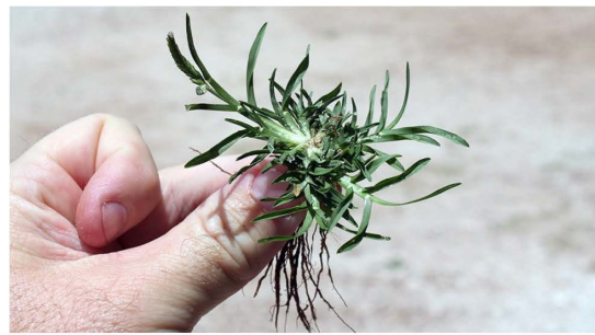
Goosegrass Eleusine indica (L.) Gaertn.