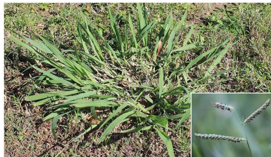
Dallisgrass Paspalum dilatatum