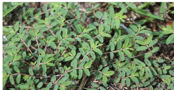
Spotted Spurge Chamaesyce maculata L.