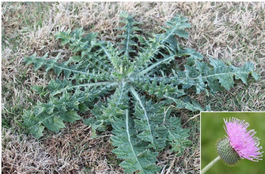
Texas Thistle Cirsium vulgare (Savi) Ten.