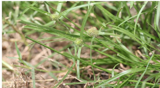
Green Kyllinga (perennial) Kyllinga brevifolia Rottb.