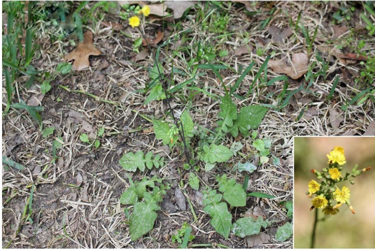
Asiatic Hawksbeard Youngia japonica L.