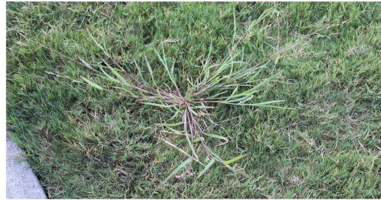
Jungle Rice Echinochloa Colona L.