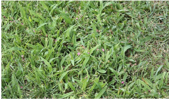
Crabgrass Digitaria spp.