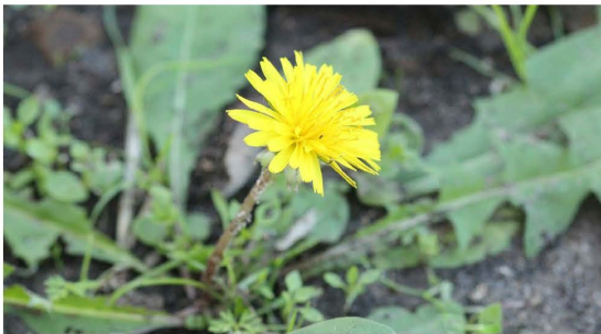
Dandelion Taraxacum officinale F.H. Wigg