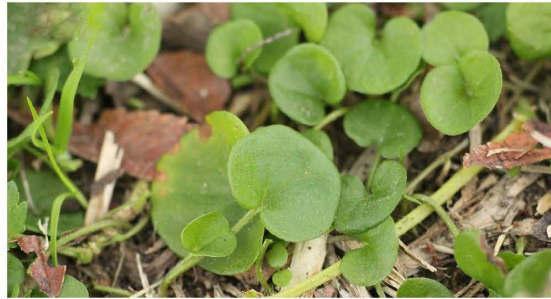
Carolina Dichondra Dichondra carolinensis Michx.