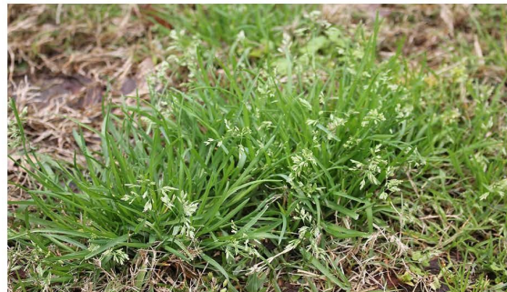
Annual Bluegrass Poa annua