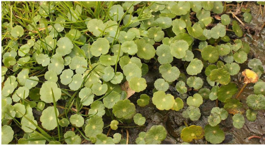
Dollarweed Hydrocotyle sp.