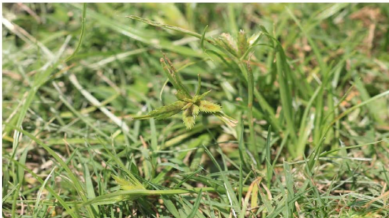
Annual Sedge (summer annual) Cyperus compressus L.