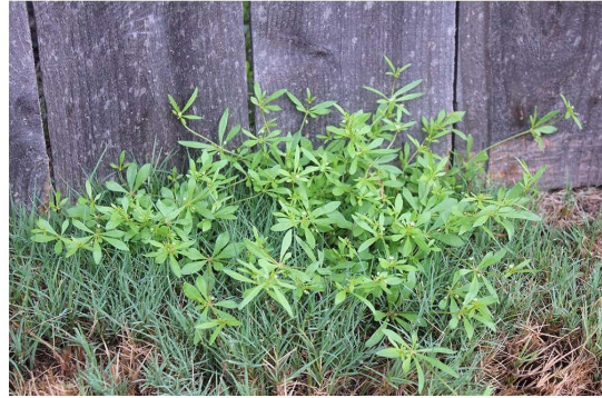
Carpetweed Mollugo verticillata L.