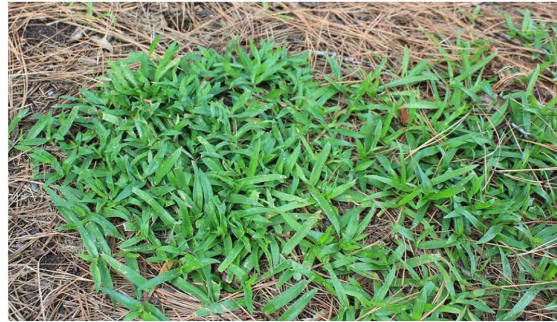
Doveweed Murdannia nudiflora (L.) Brenan