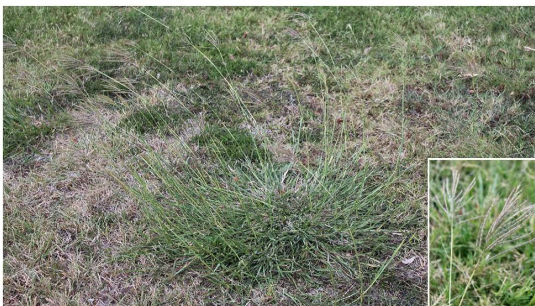
King Ranch ("KR") Bluestem Bothriochloa ischaemum (L.) Keng