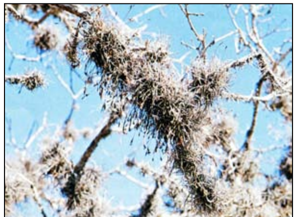
Ball moss development on post oak limbs.

Control ball moss with foliar applications of fungicides such as Kocide 101. Apply just before an anticipated rainfall. On severely infested trees, a second application may be required in 12 months. When using Kocide avoid drift to nearby sensitive plants and buildings.