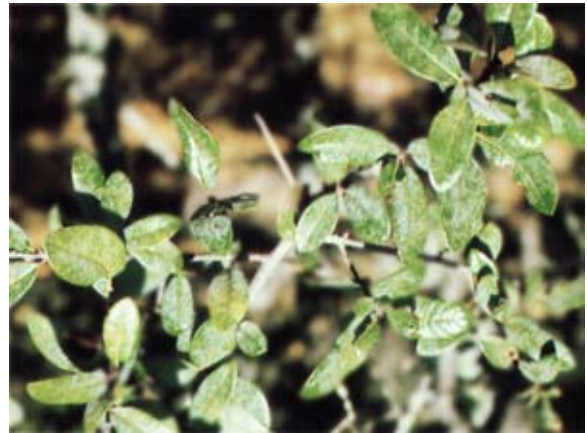
Powdery mildew on live oak leaves.