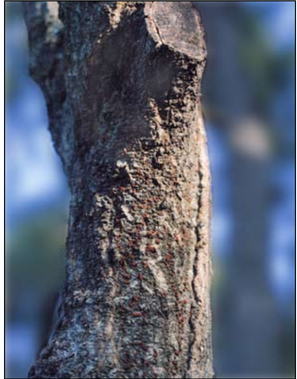
Endothia canker on red oak resulting from fungus invasion of a pruning cut.

The fungus is most damaging on trees that are in a weakened condition. Stress induced by drought, low fertility or mechanical damage predisposes trees to damage from the fungus. Trees growing vigorously are generally resistant to infection. A general maintenance program is important in preventing this problem. Prune when trees are dormant and the fungus is less active, reducing the chance of infection. When circumstances require pruning during the growing season, apply wound paints to freshly cut surfaces to prevent the fungus from coming in contact with exposed wood. Wound paints are not effective in inhibiting organisms that cause discoloration and decay. Remove limbs infected with Endothia. Fungicide sprays are ineffective in controlling this pathogen.