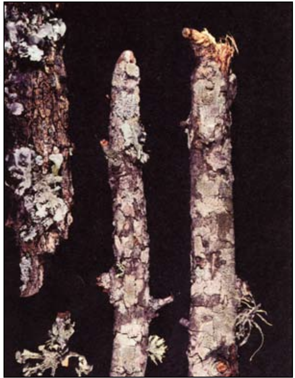
Lichens on small post oak limbs.

Lichens assume several different shapes and colors. They may lie flat on the surface or develop long stringy growths. They vary from gray to a dirty orange in color. It is not uncommon to find several different types on the same limb. Lichens may be indicators of poor growth. They require sunlight to develop and as long as the tree canopy is thick their growth is impeded by shading. Most foliar fungicides will limit their development when or if control is desired.