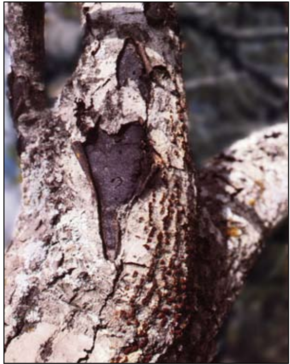
Continued development of Hypoxylon canker.

Tissue damaged by fire, construction equipment, wind and ice creates an ideal infection site for heart rot fungi. Following wounding, bacteria and non-decay fungi first invade and discolor the wood. Decay fungi then invade and destroy the inner portion of the tree. Injured trees may continue to be invaded by heart rot fungi. These fungi eventually form conks on the tree surface that produce spores having the ability to cause new infections on additional trees.