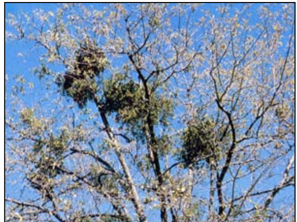
Mistletoe on pin oak tree.

The only control for mistletoe is to surgically remove the mistletoe plant and its attachment point. On small limbs make cuts 10 to 12 inches below the point of attachment. On larger limbs remove a suitable sized wood chip at the point of attachment. Chemical treatments have not proven effective.