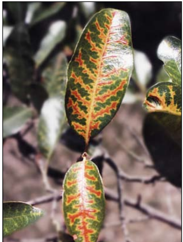
Vein banding of live oak leaves on oak wilt infested trees.

Control of oak wilt is difficult with no one method proving effective in all cases. The oak wilt fungus usually radiates rapidly once established in an individual tree or motte of live oaks. Stopping the spread of fungus from the infection center should therefore be the first objective. In stands of infected