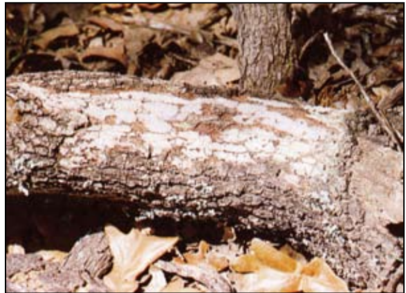
Final stage of Hypoxylon canker development.