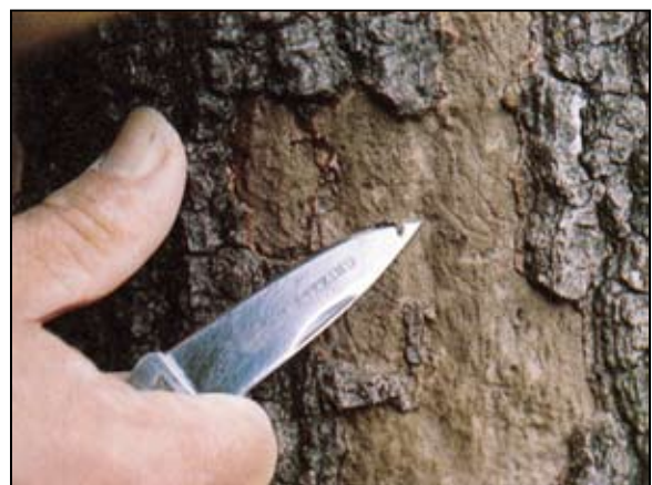
Early stage of Hypoxylon canker development on live oak.

Trees with Hypoxylon canker first appear chlorotic and develop thin foliage. In severe cases leaves die quickly and turn a light brown. They may cling to the tree for a short time. Soon after foliar systems develop, fungal structures may be observed on limbs and trunks. The rough, outer bark separates from the limb and trunk. On the wood where the bark sloughs, a reddish brown to olive green spore material with a dusty appearance forms. Soon thereafter a dark brown to black crusty material forms. The color of this material varies