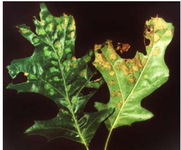
Oak leaves infected with the oak leaf blister fungus.

The fungus overwinters in fallen leaves. Spores are moved in the spring by air currents to healthy foliage where infection occurs. In most areas, symptoms are observed around midsummer and during the fall. Newly planted trees or those weakened from other causes appear to be the most severely damaged.